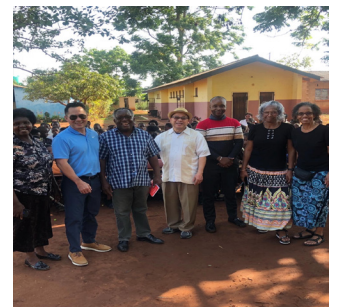
UBC on mission in Tanzania