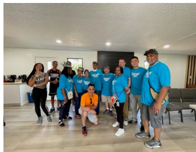
UBC on mission in Los Angeles