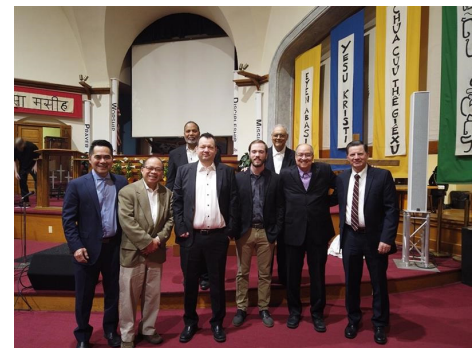
2024 Good Friday Preachers

This promises to be a blessed time. Our service will start at 6PM. Earlier I asked if there was a more significant event in human history. There was one which topped this, but you will have to come back Easter Sunday to hear about that. He became death for us, but also defeated death, and by being in Him we will live.